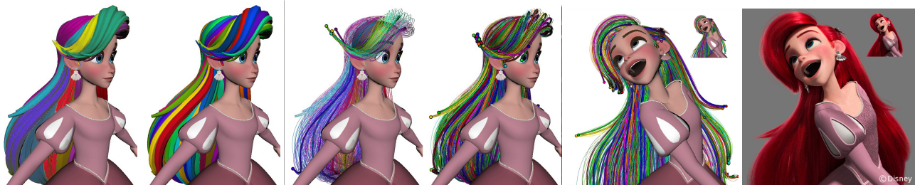
Figure 1: Hair Hierarchy. Left) Groom Hierarchy level 0 and level 1. Middle) Hierarchical sculpting tool (thick curves are the control curves) level 0 and level 1. Right) Result of post-sim hierarchical sculpt (inset: original simulation result), rendered result.

Brian Whited* Walt Disney Animation Studios