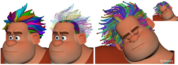
Figure 2: Left) Groom tubes, output curves and clump map. Right) Post-sim sculpt to restore stylized silhouette (inset: output of sim).

This grooming tool, first developed on Frozen , has been used on a wide variety of hairstyles and productions. Initially, the hierarchy implicit in this coarse-to-fine workflow was transient. In the current workflow, the hierarchy is explicit and a first-class component of the grooming process. The clumps produced by subdivision are assigned as children in a persistent hierarchy to their original coarse parent. The two coarsest levels of a groom hierarchy are illustrated on the left in Figure 1. The hierarchy provides efficient construction of the groom, as well as a means of capturing the desired structure to be passed to subsequent departments.